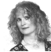
Chelydra Newport News, VA

Routines are limited to seven minutes (but remember, less is sometimes more). Music must be on CD-R (not CD-RW). MP3 format is NOT supported.